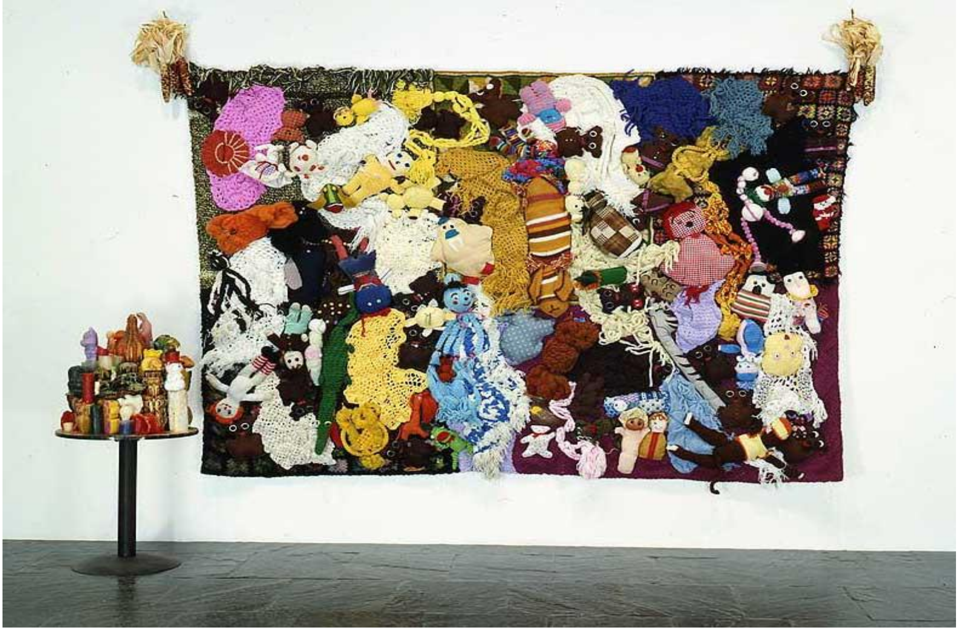
https://art21.org/read/mike-kelley-language-and-psychology/ © Whitney Museum of American Art, New York.